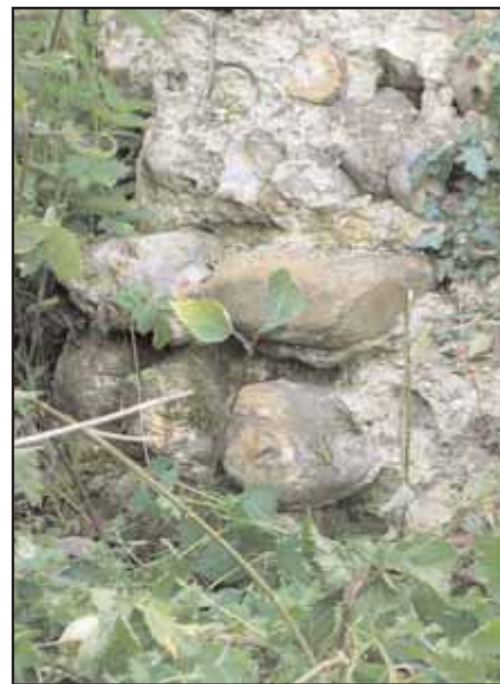
Is this the remains of steps in the old Wiveton harbour wall, or the remains something else? Wiveton was once a very important harbour, which was superseded by Cley and then Blakeney.