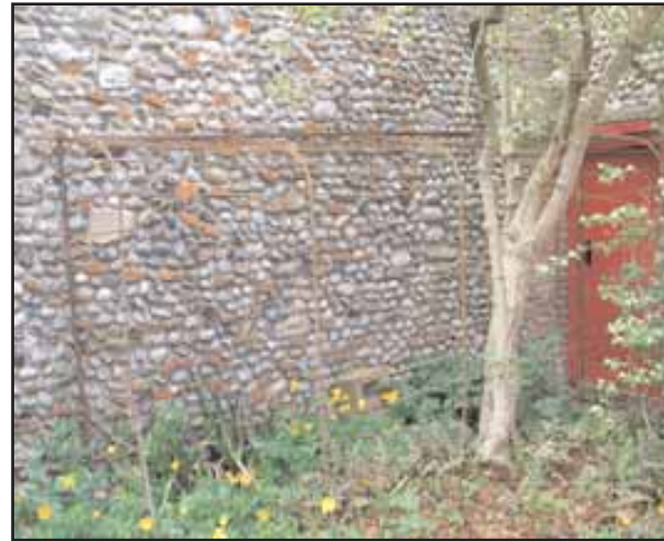
The entrance to the three-seater privy on the e of Church Farm, Wiveton.

Above: On the top of Wiveton Downs. Below: On the way to the old gravel quarry. One crop grown on the farm - spring beans - has an unusual destination - Egypt - to be eaten during Ramadan.